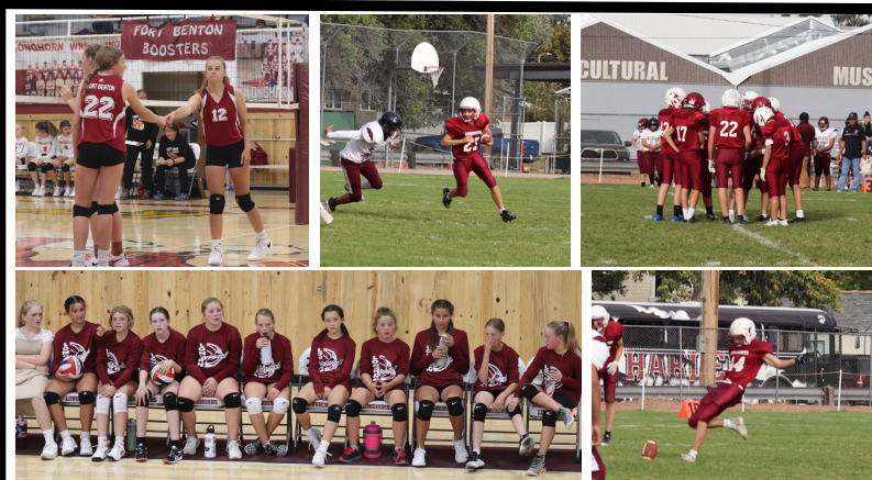
The First Fall Finishers: All of the middle school seasons wrapped up the past few weeks, and they are beginning their winter seasons, as basketball started this past couple of weeks.

All together, the middle school sports teams had great seasons. Next up for winter middle school athletics is 7th & 8th grade basketball, which just started in the past couple of weeks. It will be followed by wrestling and 5th & 6th grade basketball shortly thereafter.